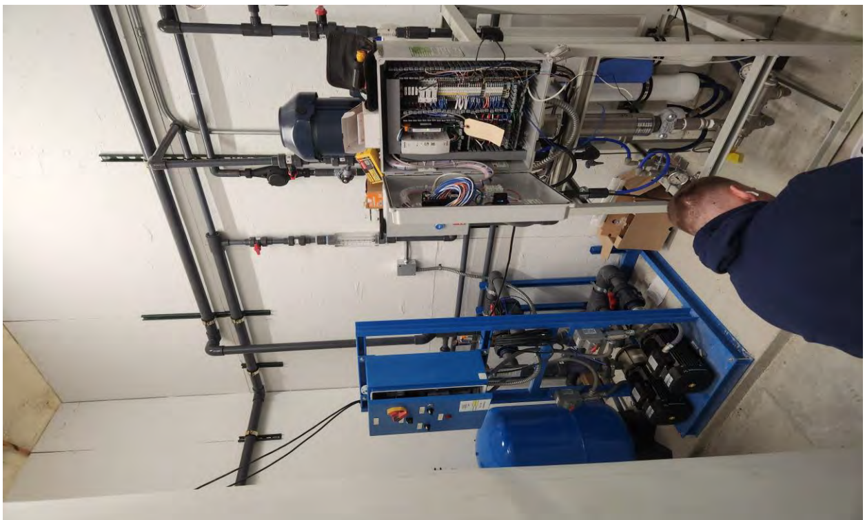
Complete Water at Start Up Still Troubleshooting/RO Skid Installed