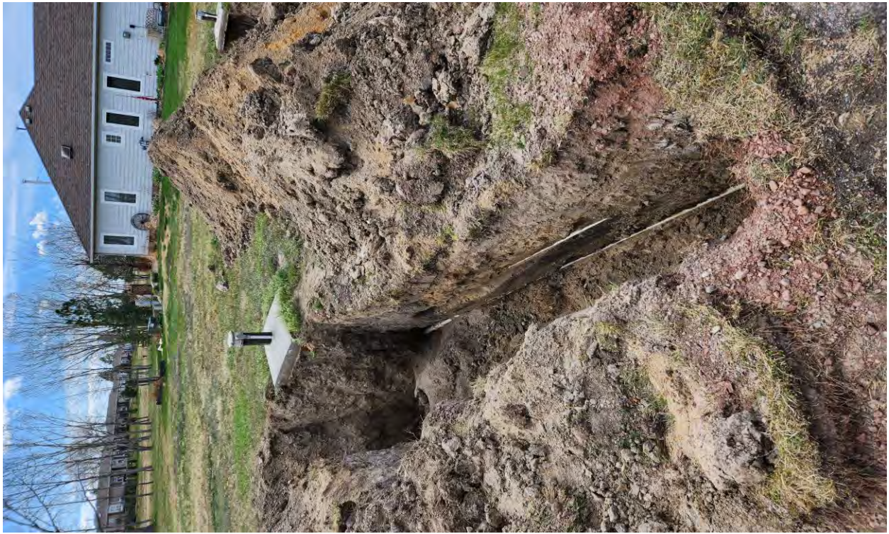
Digging up System Looking For Tees in Existing System