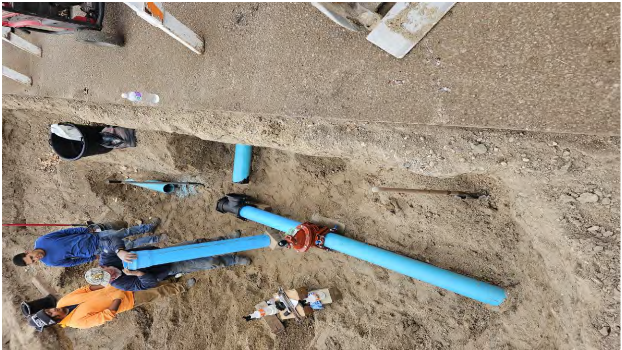
Long's Excavation tying distribution system together (Location 1)