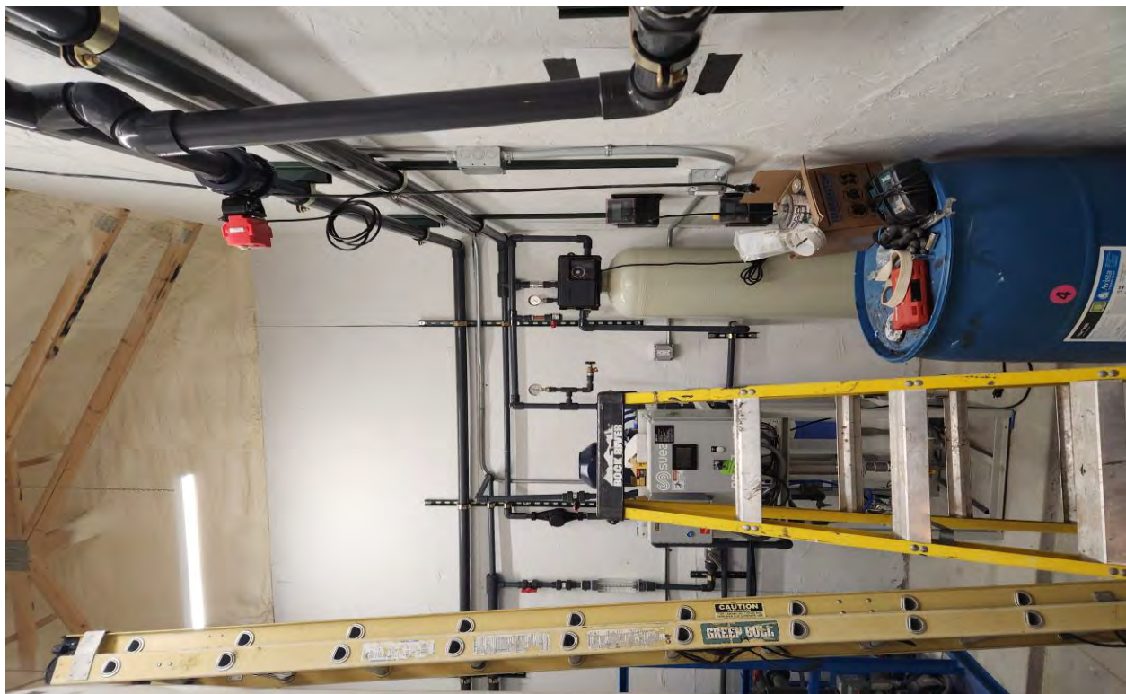
New Treatment System Reverse Osmosis & Pre-Filter Installed