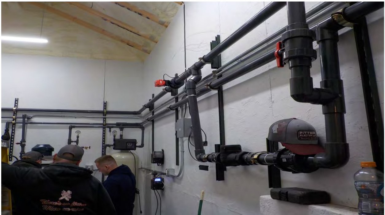
Complete Water & Contractors at Start Up