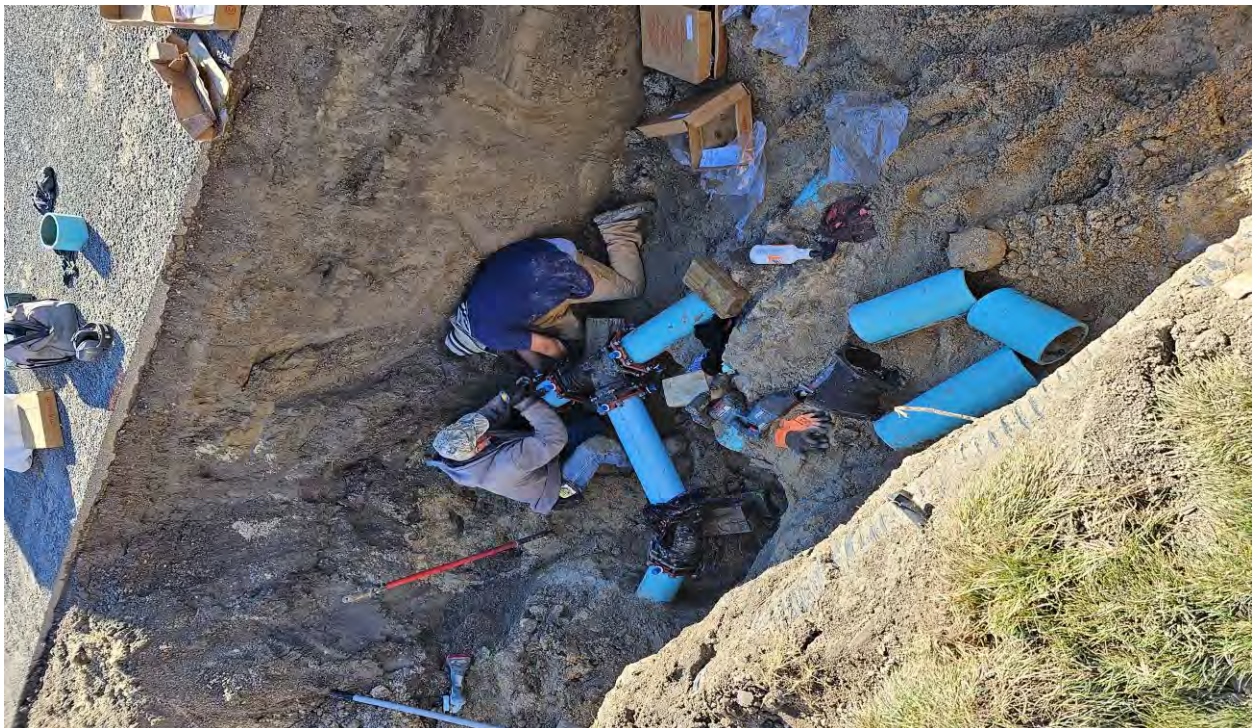
Long's Excavation tying distribution system together (Location 2)