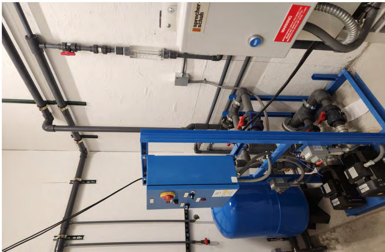
New Treatment System High Service Pump Skid Installed