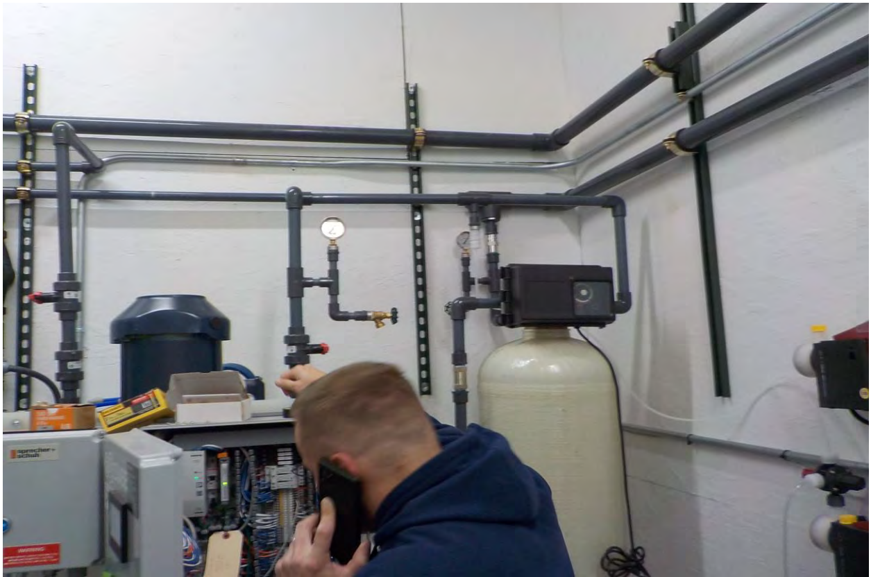
Complete Water Tech Working through Issues at Start Up