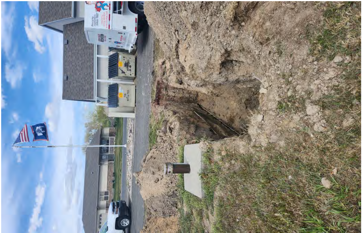
Digging up System Looking For Tees in Existing System