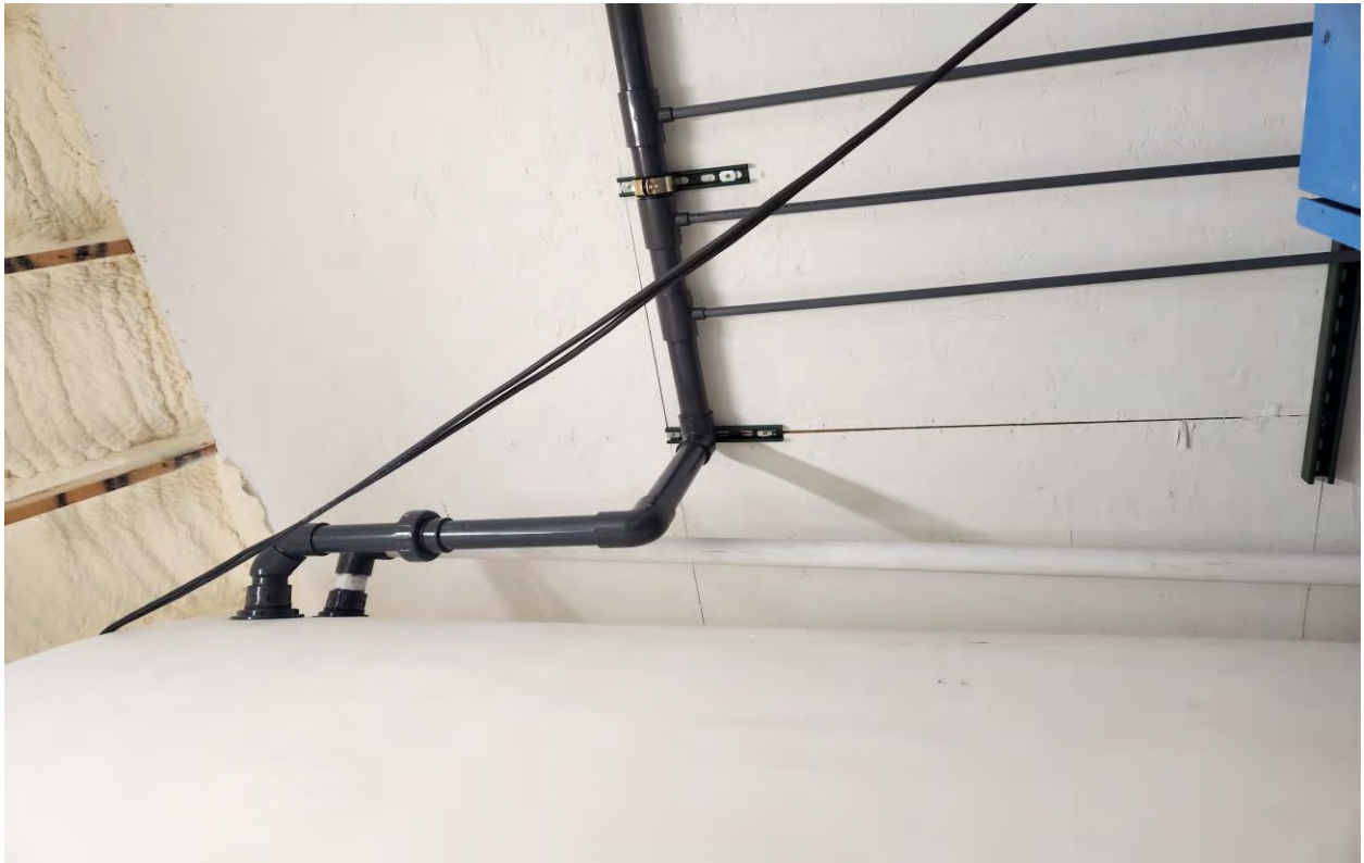
New Treatment System Blend Tank Installed