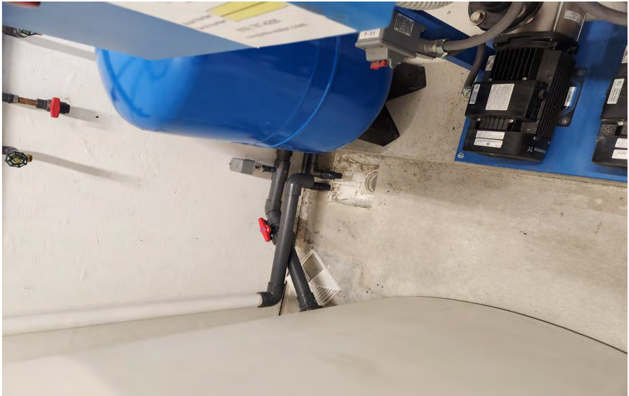
New Treatment System Pressure Tanks and High Service Pumps Installed